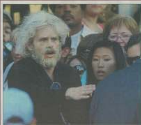
Pratt by name... Reality TV star Spencer Pratt, 26, tries to catercorner the LA premiere of Inception disguised as an old man. The Hills star was escorted away from the red carpet by security

crashed havoc with her career plans for this year. Hough, 25, was reportedly in tears as he was said to be one of the few people allowed by her side while she was in the ICU. Cole has been forced to pull out of the boot camp stages of this year's X Factor, which is due to start next week. As a result producers have been forced to change the format, dropping the live audience from that section of the show. The Girls Aloud singer has also derided her highly anticipated solo showing at next month's V Festival, where she was billed as one of the headline acts. Fellow judge Simon Cowell told the Georgia beauty her full health must be her priority before she returns to work.